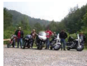
Coast Bike Run. This is huge for us

Finally I want to encourage everyone to come out and support the Noble Eagles Mid